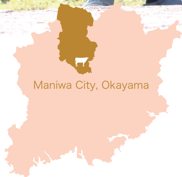
Maniwa City, Okayama

Maniwa City, Okayama is a region that boasts of the largest number of Jersey cattle in Japan.